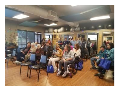
Multiple Sclerosis & Disabilities Expo 2018 Held at Rezac & Associates